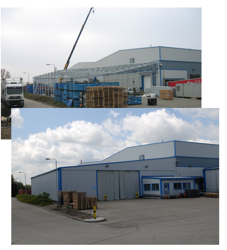
TRELLEBORG AUTOMOTIVE Width 24m x length 28m x internal height 5m