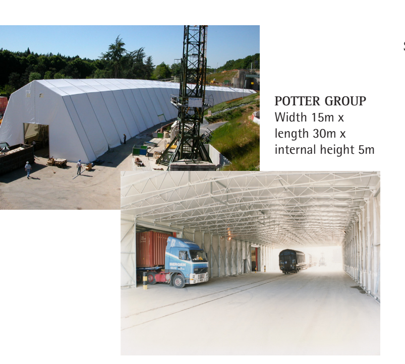
SWISS AIR FORCE Width 15m x length15m x internal height 6m

These sectors are very challenging and demanding but with CopriSystems' large product range can be overcome. The strong but lightweight steel and aluminium structures lend themselves to many different solutions whilst the Glulam wood offers ideal protection for salt stores.