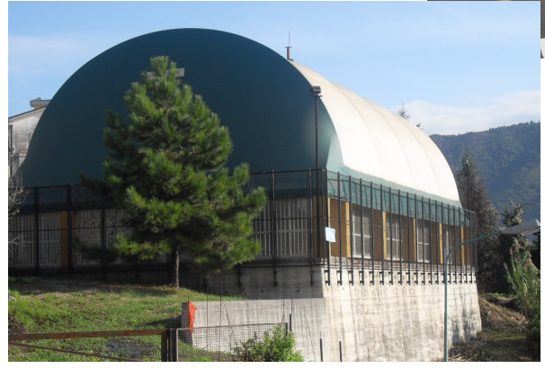
GLULAM SALT STORE Width 18m x length 25m x internal height 9m