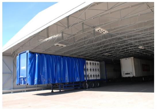
INDESIT HOTPOINT Width 21m x length 31m x internal height 5.5m

In any industrial environment, having robust and practical buildings to protect against the elements and security threats is a must. We offer turnkey projects for the logistics, manufacturing and storage sectors with canopies, tunnels, portal frames and domes to be freestanding or mounted to existing structures for use as permanent or temporary.