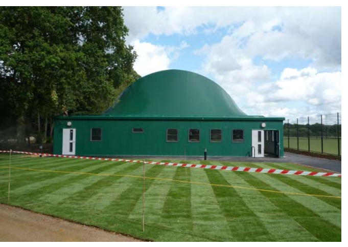
AKELEY WOOD SENIOR SCHOOL Width 18m x length 36.5m x internal height 9m width changing facilities and office