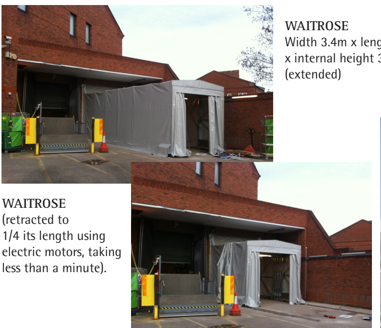
Width 3.4m x length 9m x internal height 3.9m

The retail sector requires unique systems whilst remaining aesthetically pleasing. With CopriSystems' vast experience in bespoke structures, they're able to adapt and supply a covering system fit for purpose. We offer turnkey projects, including planning and building control applications, using our in-house expertise.