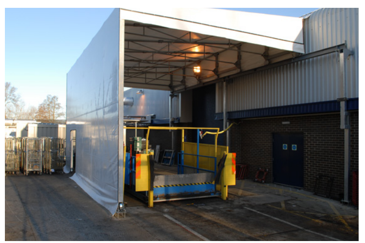
SAINSBURYS Width 6.2m x length 10m x internal height 5.2m