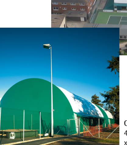
GREENACRE SPORT CENTRE 4 no. 18m wide x 36.5m long x 9m high tennis domes