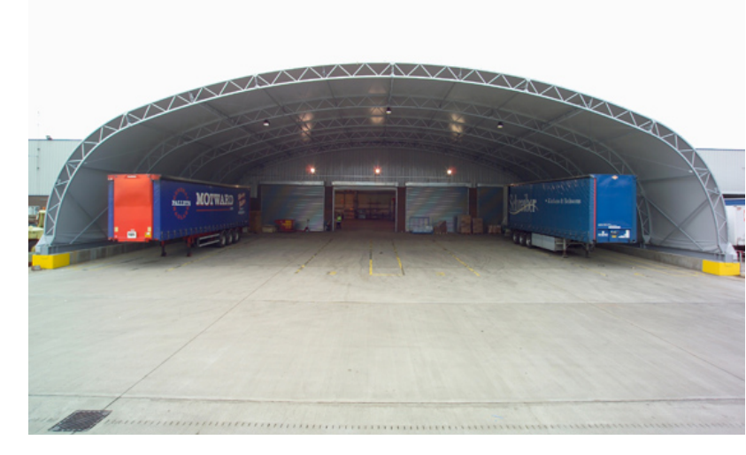
HOWDENS JOINERY Width 32m x length 22m x internal height 9m