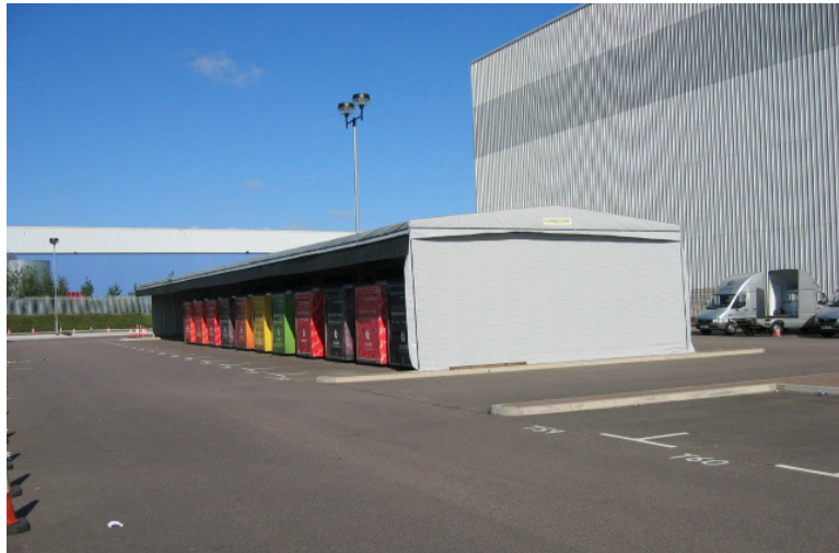
OCADO Width 9.24m x length 47m x internal height 3.6m