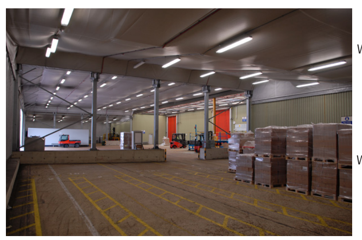
GLAXOSMITHKLINE Width 64m x length18m x internal height 6m