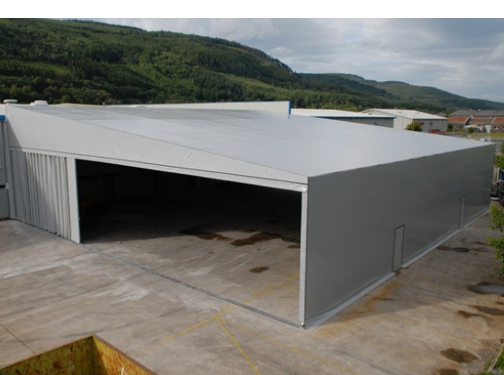
JTEKT AUTOMOTIVE Width 24m x length 26.64m x internal height 5m