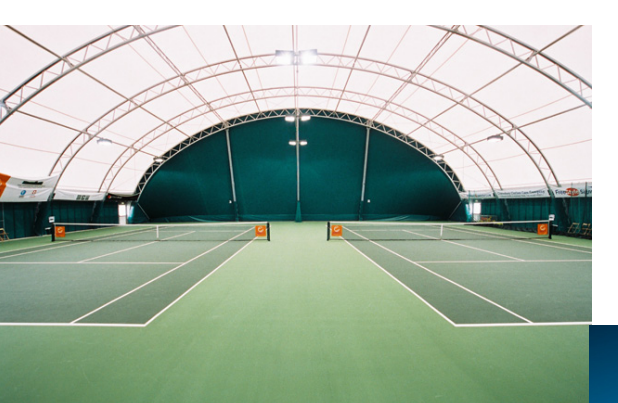
APPETI TENNIS Width 37.5m x length 37.5m x internal height 11m

CopriSystems offers a full turnkey project as principal contractor. This incorporates design and specification with customers input throughout to gain their preferred outcome to suit the budget. The structures are tailor made for the sport and environment with Glulam wood a popular frame material for its warmth, allowing the internal area to be used for other activities. CopriSystems' unique full length sliding side curtains allow natural ventilation and gives an outdoor feeling.