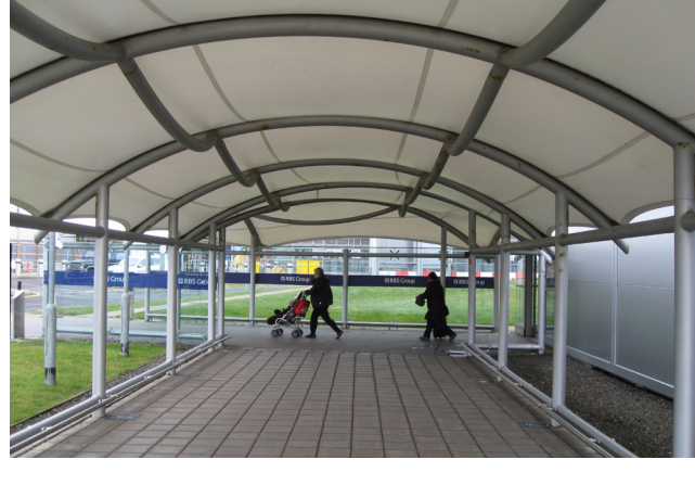
WALKWAY Width 5.8m x 3m high